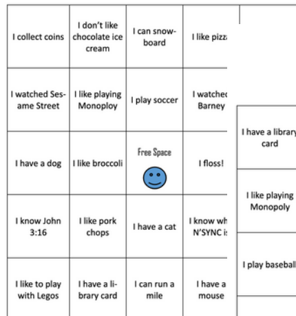
Friend Bingo 2