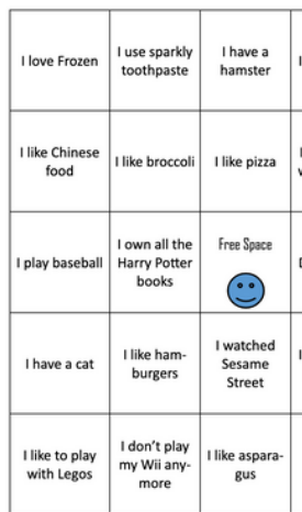
Friend Bingo 1