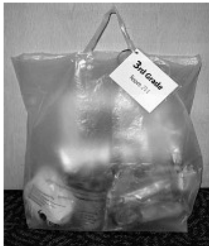
Shared Supply Bag

Your classroom may have a 5-drawer plastic cart on wheels with administrative and general craft supplies. The drawers are labeled with the contents in order to return items to the proper place so others can easily find them. The "Shared Supplies" bag, labeled by classroom, contains the lesson supplies to be shared by all CTs. Please return all supplies to the bag for the next team's use.