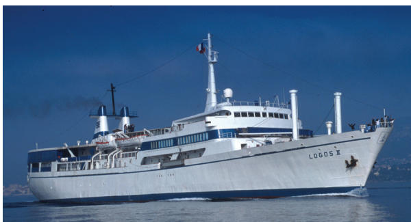
LOGOS II 1989–2008