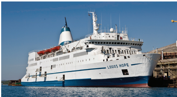
LOGOS HOPE 2004–NOW