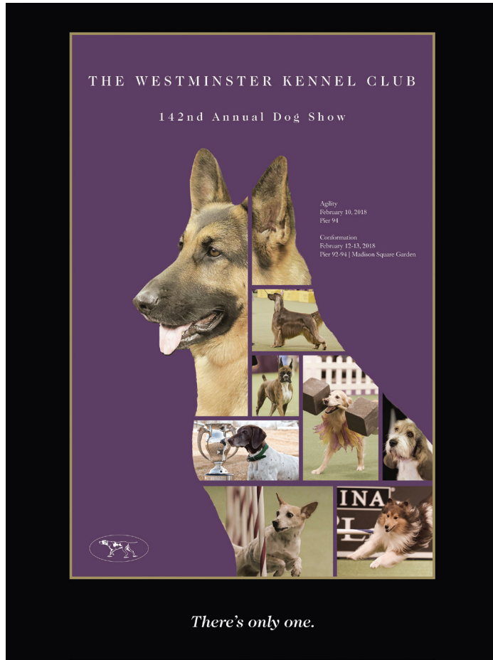
2018 Westminster Poster Actual Size: 18" x 24"