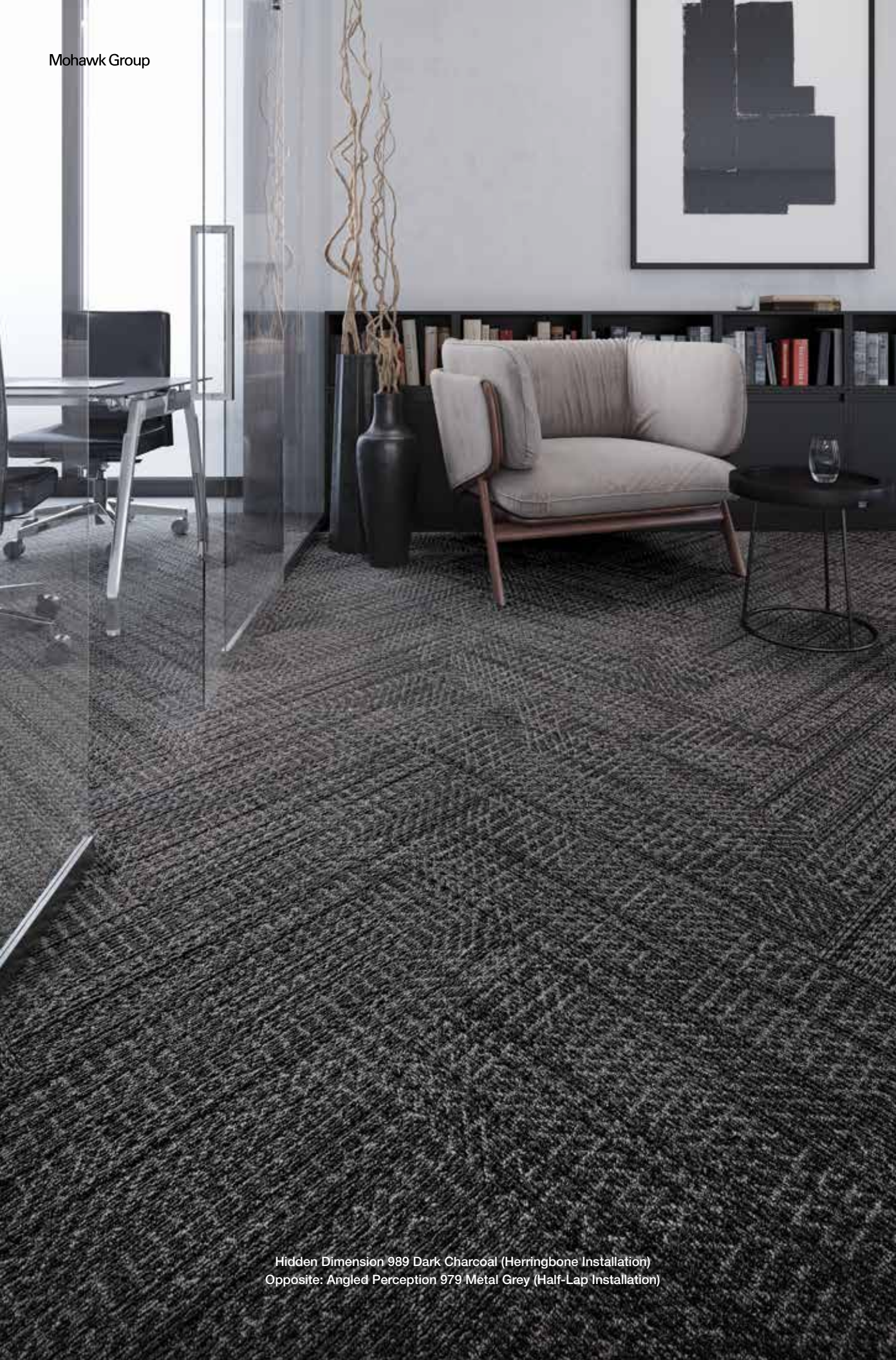
Hidden Dimension 989 Dark Charcoal (Herringbone Installation) Opposite: Angled Perception 979 Metal Grey (Half-Lap Installation)