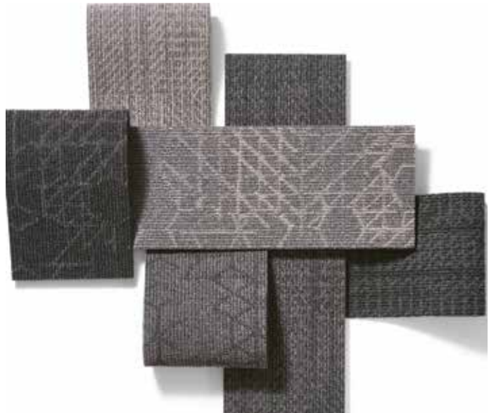
Cover: Angled Perception and Hidden Dimension 979 Metal Grey, 989 Dark Charcoal (Half-Lap Installation)

Change your perspective with Visual Edge, a new take on hierarchy and structure that creates a flowing graphic pattern derived from nature. This biophilic hexagonal design comes in two plank styles that layer elements and change scale to guide you through space, similarly to a bird's eye view of the ground below. Patterns in a space can shrink or grow in scale to adjust to the changing formats of space in the built environment.