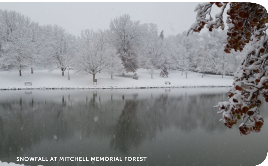
SNOWFALL AT MITCHELL MEMORIAL FOREST

Kick your weekend off with a little R&R: rest and recreation. Join certified instructors on the trail to learn quick, easy ways to de-stress with mindfulness and meditation while picking up day hiking tips along the way. Be sure to pack water and dress for the weather.