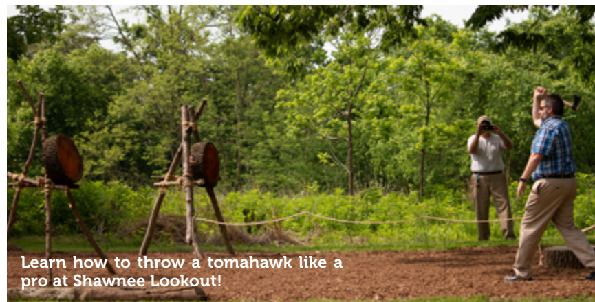
Learn how to throw a tomahawk like a pro at Shawnee Lookout!

Jump and skip with stilts and hoops as you join forces with pioneer students, who are trying to skirt the wrath of schoolmaster Dooley. Use your wit to avoid lessons and revel in the tomfoolery of frontier fun and games! Shawnee Lookout/Historic Cabin Area (✓)