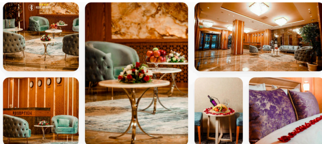
Regal Inn Hotel or Similar: AED 6,760/- for two adults