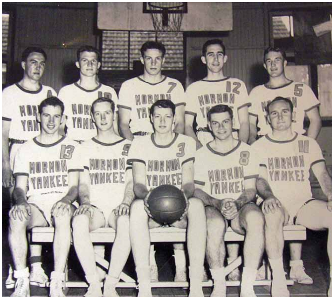
Mormon Yankees basketball team, 1956.