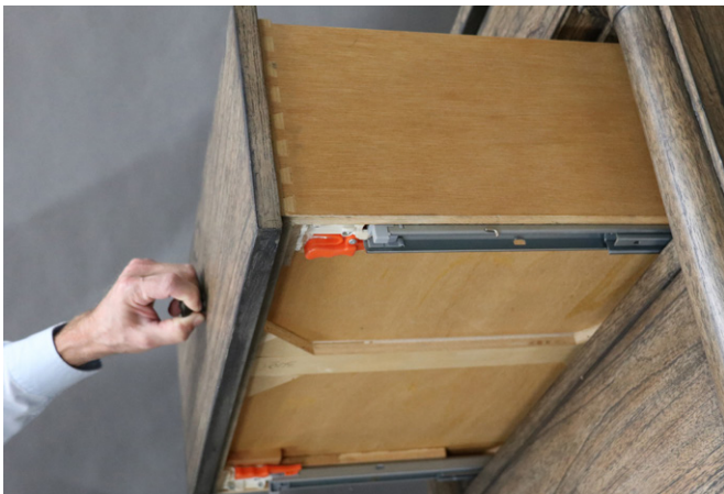
2-Open drawer view (JPG - STILL)