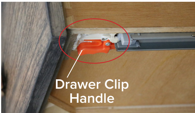
3-Close-up drawer clip (JPG - STILL)