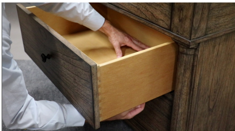
Part 2_Install Drawer (MP4 VIDEO)