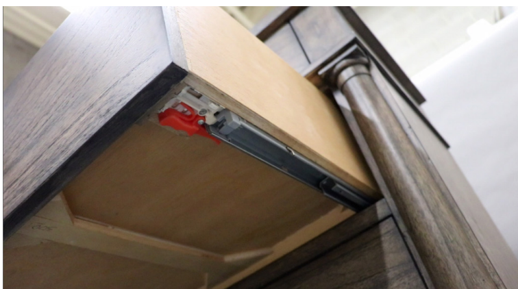
Part 1_Remove Drawer (MP4 VIDEO)