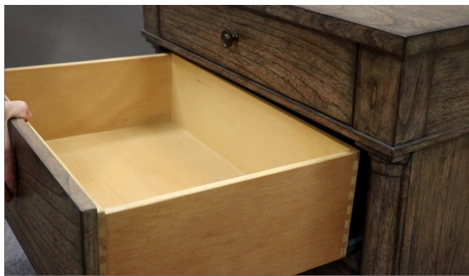
Part 2_Install Drawer (MP4 VIDEO)