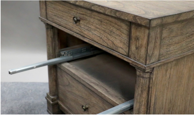
Part 2_Install Drawer (MP4 VIDEO)