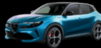
Navigli Blue / Black Roof