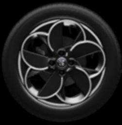
1M5 - 18" Petali alloy wheels diamond cut