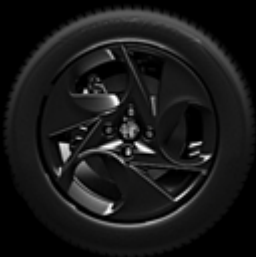
17" Alloy wheels diamond cut