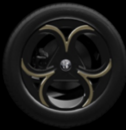
WDR - 18" Fori alloy wheels gold