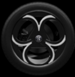
WP8 - 18" Fori alloy wheels