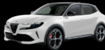
Sempione White / Black Roof