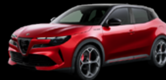
Brera Red / Black Roof