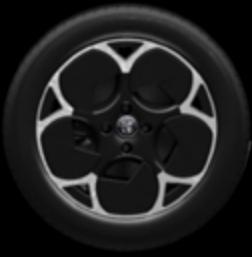
2VX - 18" Aero alloy wheels diamond cut