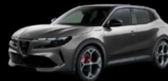
Arese Grey / Black Roof