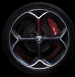
5RK - 20" Venti alloy wheels diamond cut