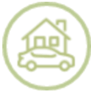
Living with an EV

If you're thinking of switching to an electric car, but want to know more, then it's time to Discover EV with Kia. You can get expert advice about living with an electric car at your local dealership.