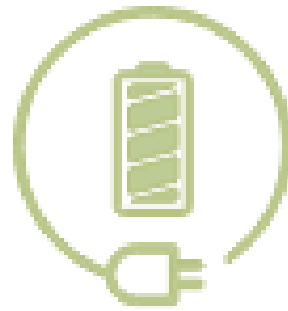
Charging & Range