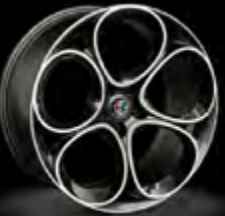
3CX - 19" Dark petal design alloy wheels