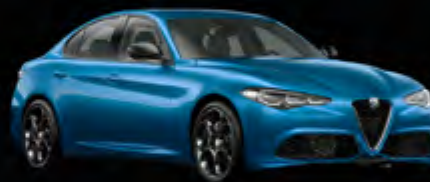
756 Misano Blue