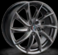
3CO - 18" Dark 10-spoke turbine alloy wheels