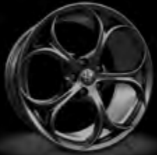
3CV - 19" Dark alloy wheels