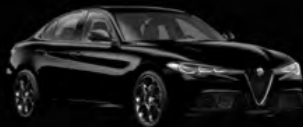
408 Volcano Black