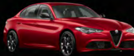
414 Alfa Red