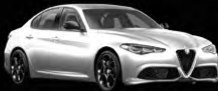
240 Banchise White