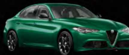
398 Montreal Green