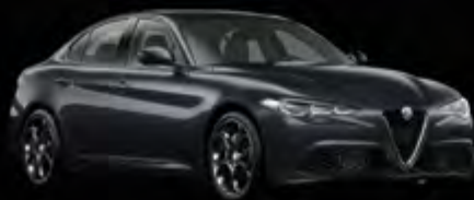
035 Vesuvio Grey