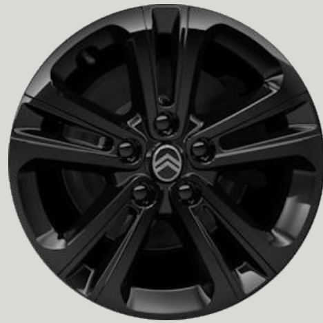
16 inch 'Starlit' alloy wheels Optional on PLUS as part of Style Pack.