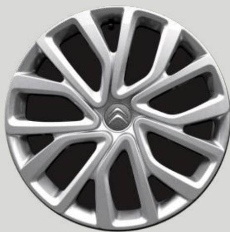
16 inch steel wheels with 'Twirl' wheel trims Standard on PLUS.