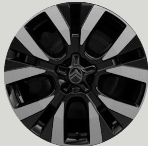
17 inch 'Topaz' alloy wheels Standard on MAX.