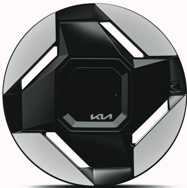
19" Alloy Wheels with Aero Covers - Air