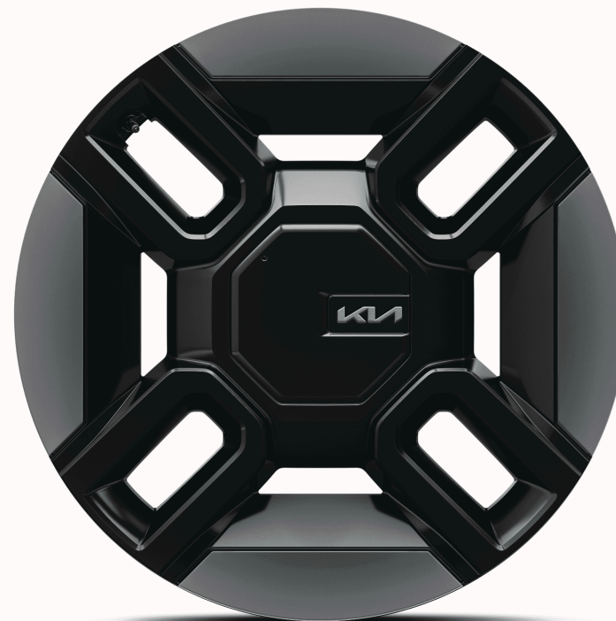
21" Alloy Wheels with Aero Covers - GT-Line/S