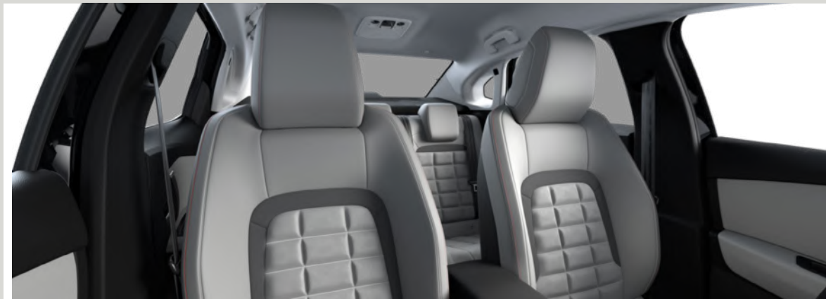
Alcantara ambience Optional on MAX. Image shown for illustration only; does not reflect right-hand-drive UK version