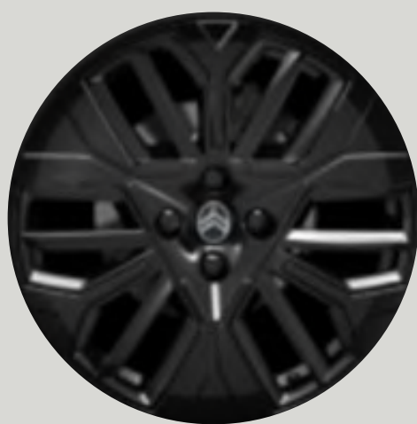
18 inch "Amber" alloy wheels Black painted finish with anti-theft locking wheel nuts Optional on MAX