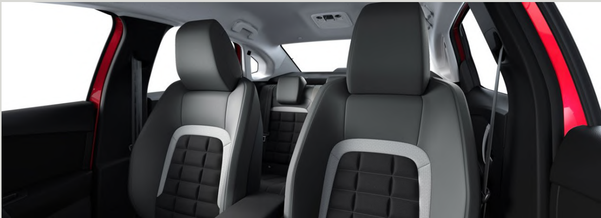
Urban Grey ambience Standard on PLUS.