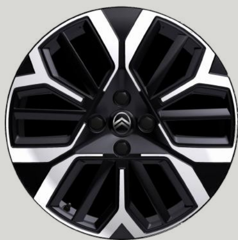
18 inch "Amber" alloy wheels Bi-tone (Orbital Black / Aluminium) finish with anti-theft locking wheel nuts Standard on all models