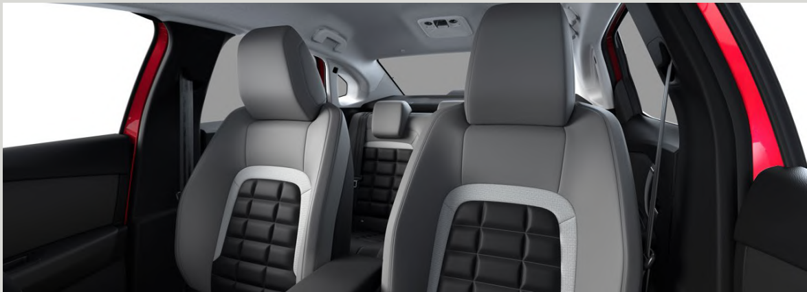
Metropolitan Grey ambience Standard on MAX.