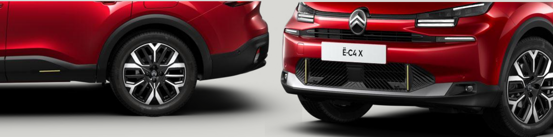
Gold Satin (standard on MAX)