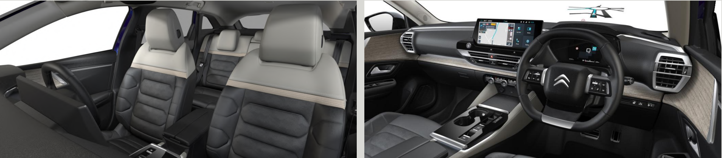
Hype Adamantium ambience Optional on MAX.