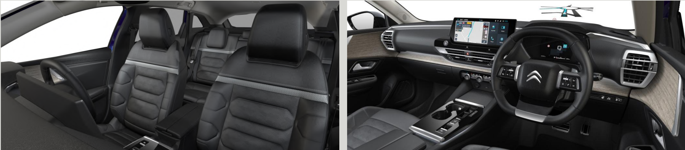
Hype Black ambience Standard on MAX, optional on PLUS.