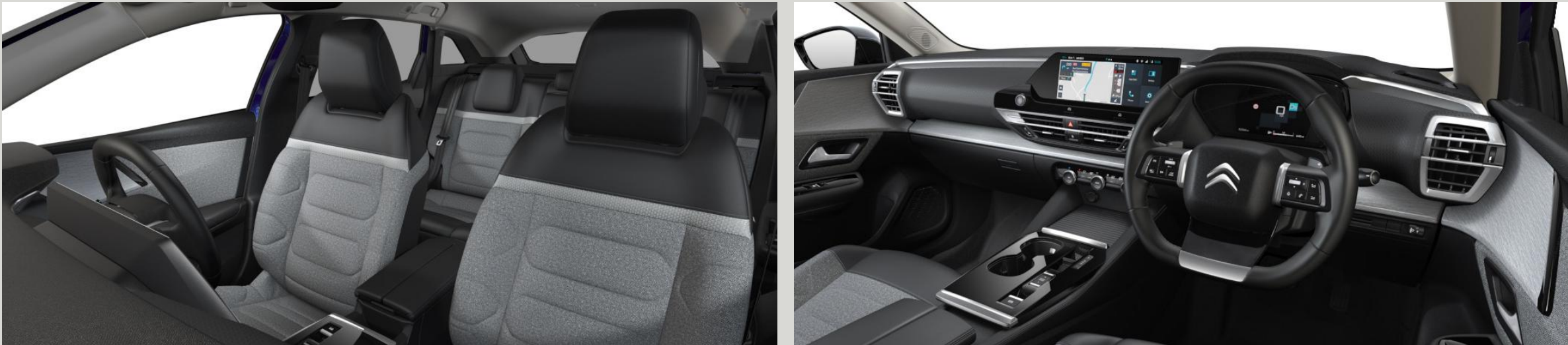
Urban Grey ambience Standard on YOU!