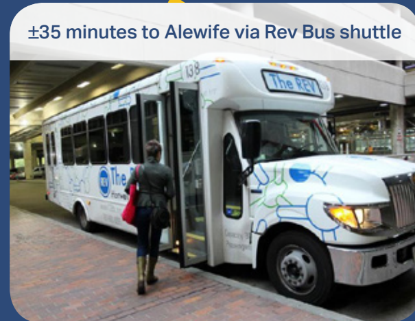
±35 minutes to Alewife via Rev Bus shuttle