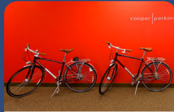
Direct access to Minuteman Commuter Bikeway