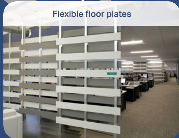
Flexible floor plates