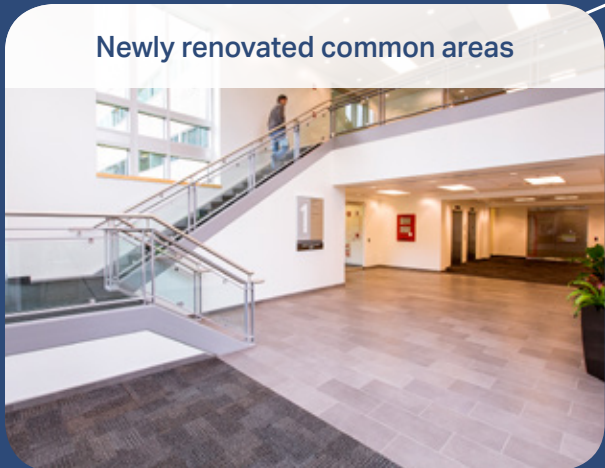
Newly renovated common areas