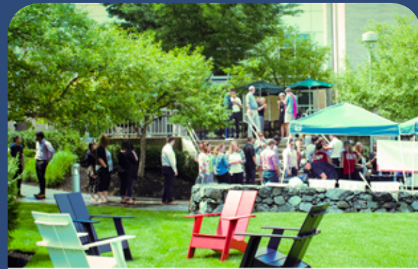
Outdoor collaborative areas