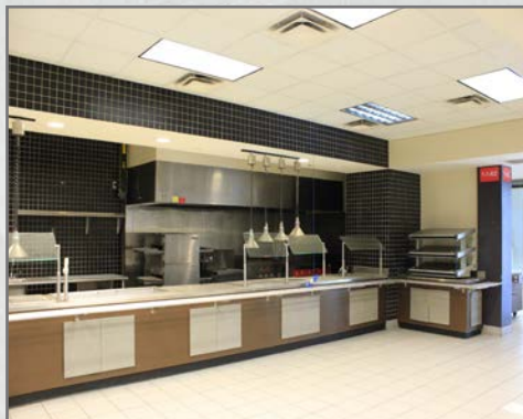
Full Service Kitchen