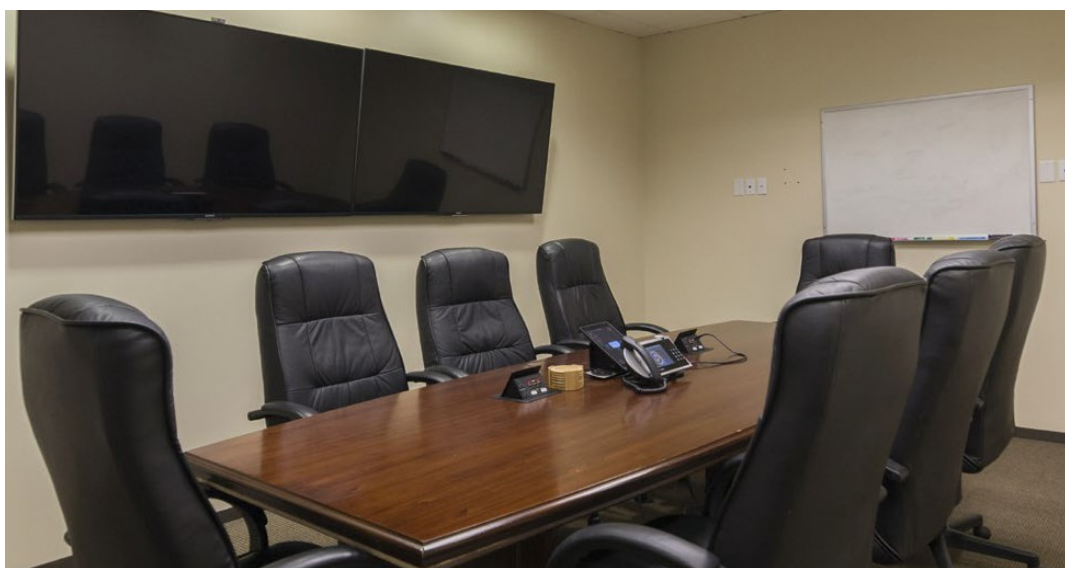
Interior conference room