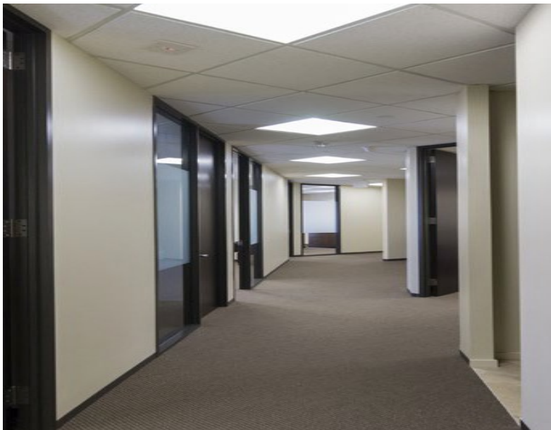
Private offices with side lights