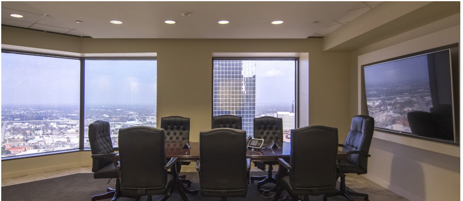
Large conference room