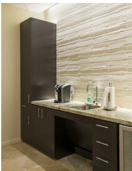
Coffee bar near reception