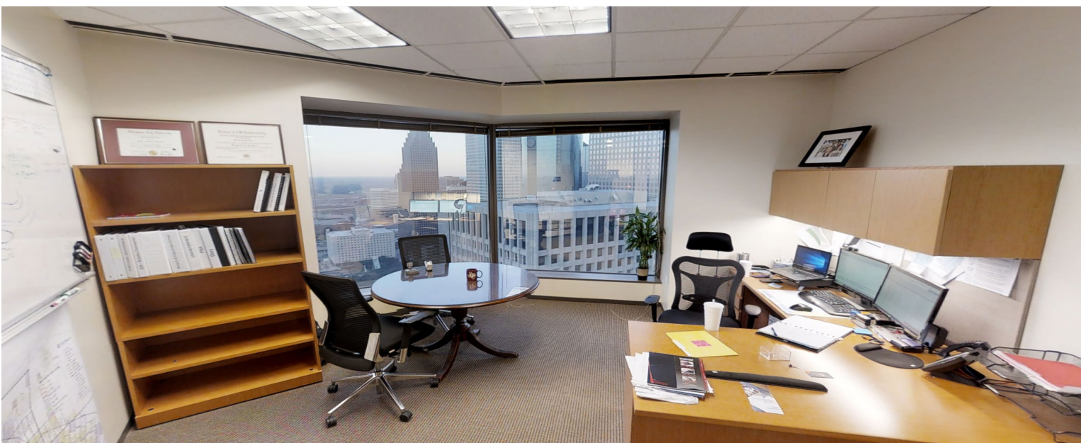
Large private office

The information contained herein is obtained from sources believed to be reliable. However, Jones Lang LaSalle makes no guarantees, warranties or representations as to the completeness or accuracy thereof. The presentation of this property is submitted subject to errors, omissions, change of price or conditions, and is subject to prior sale, lease or withdrawal without notice.