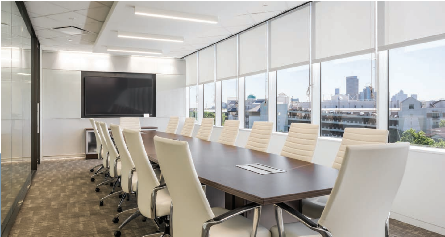
Corporate Interior Space