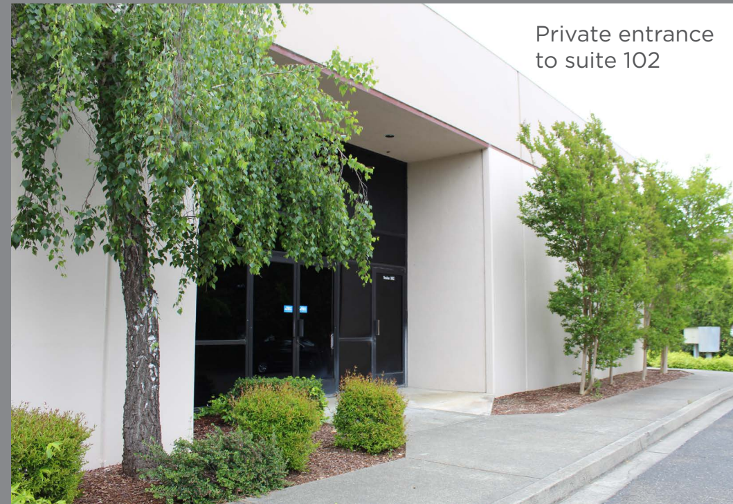
Private entrance to suite 102