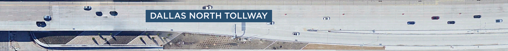
DALLAS NORTH TOLLWAY