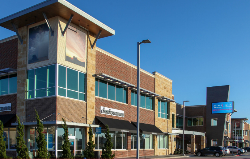
2 ND FLOOR SPACE FOR LEASE