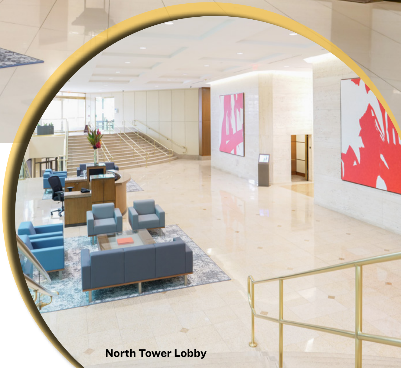
North Tower Lobby