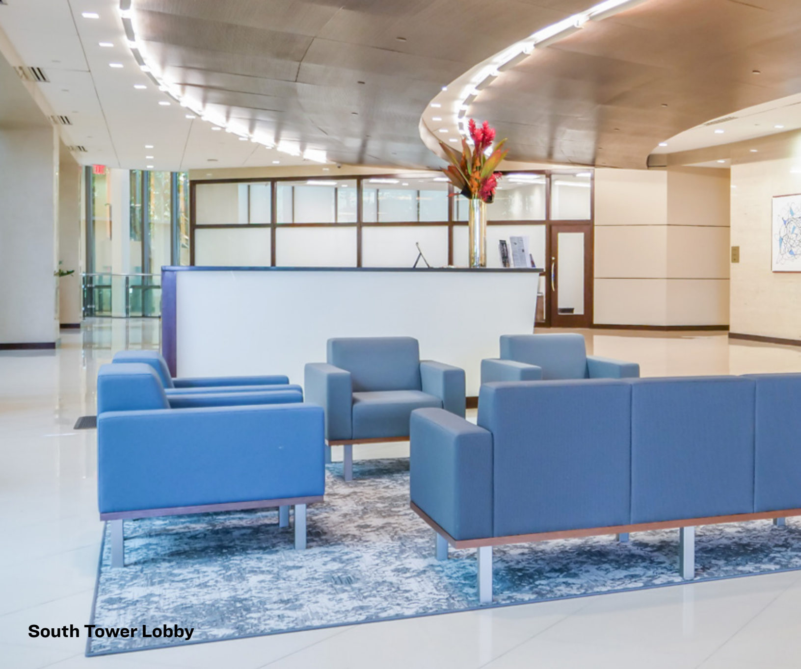
South Tower Lobby