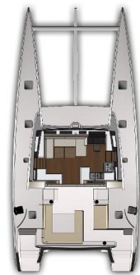
Outremer 5X deck layout