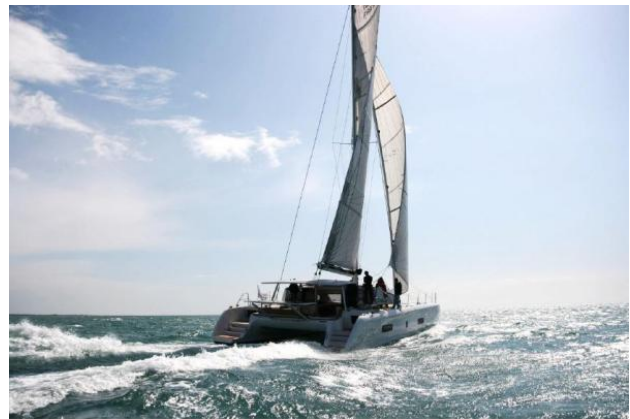
Outremer 5X sailing