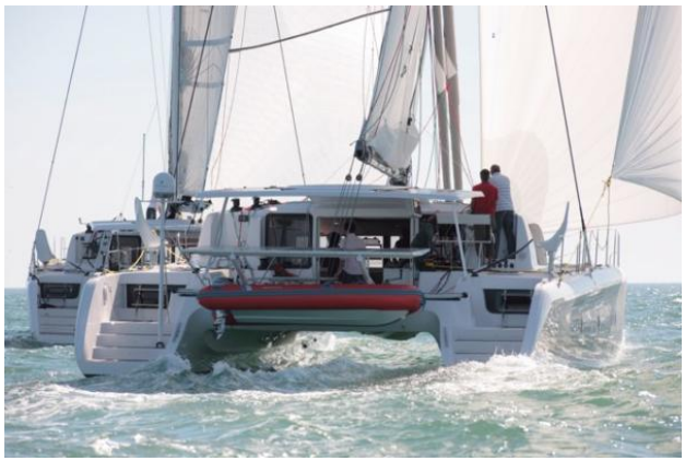
Outremer 5X aft view