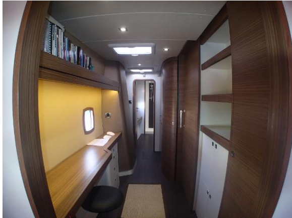
Outremer 5X Master Stateroom