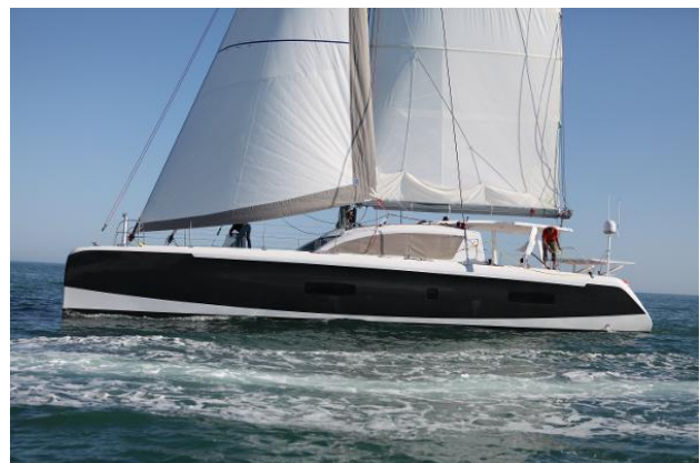
Outremer 5X Hull color options