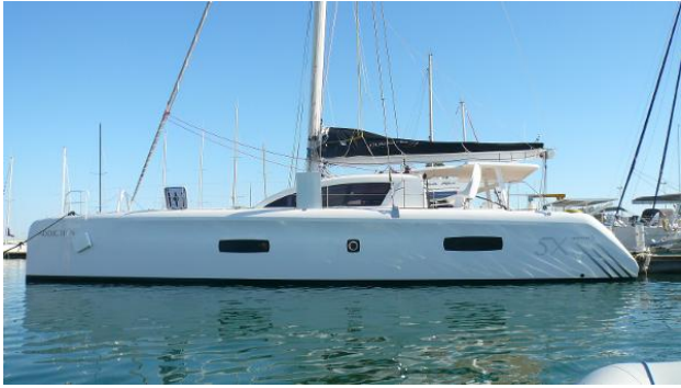
Outremer 5X exterior profile