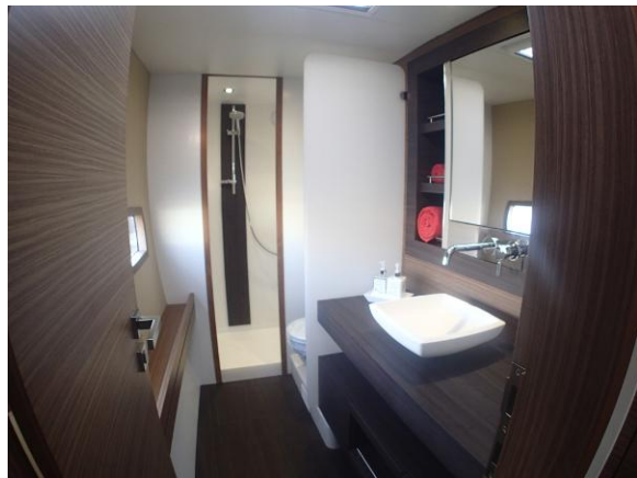
Outremer 5X owner washroom