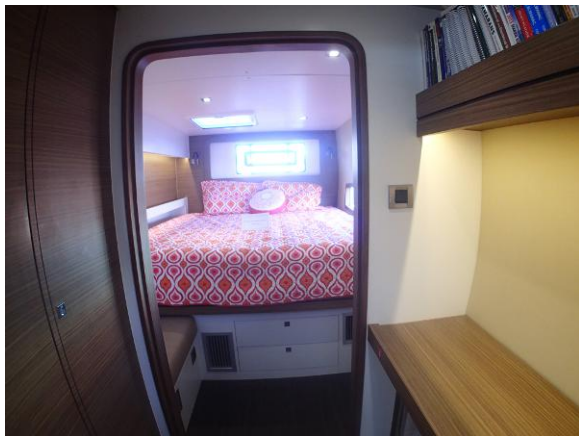
Outremer 5X Master berth