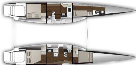
OUTREMER 5X Cabin Deck - Owner version + skipper 2016-17-20