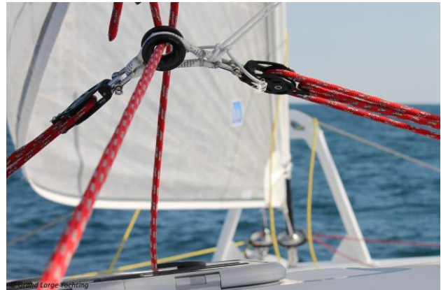
Outremer 5X Specialized Rigging Available