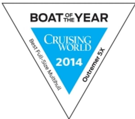
Outremer 5X Best Full Size Multihull 2014