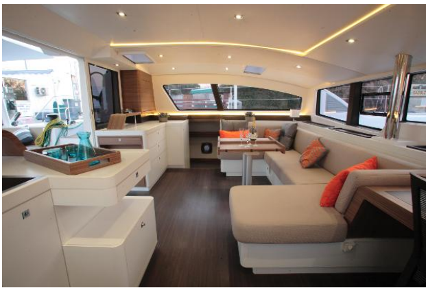
Outremer 5X Salon Interior