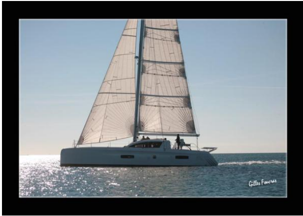
Outremer 5X Luxury Performance Catamaran