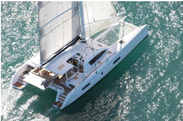
Outremer 5X aerial view