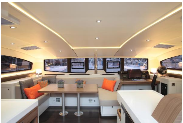
Outremer 5X Salon Interior