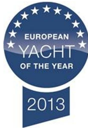
Outremer 5X European Yacht of the Year 2013