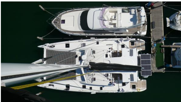
Outremer 5X View from Mast