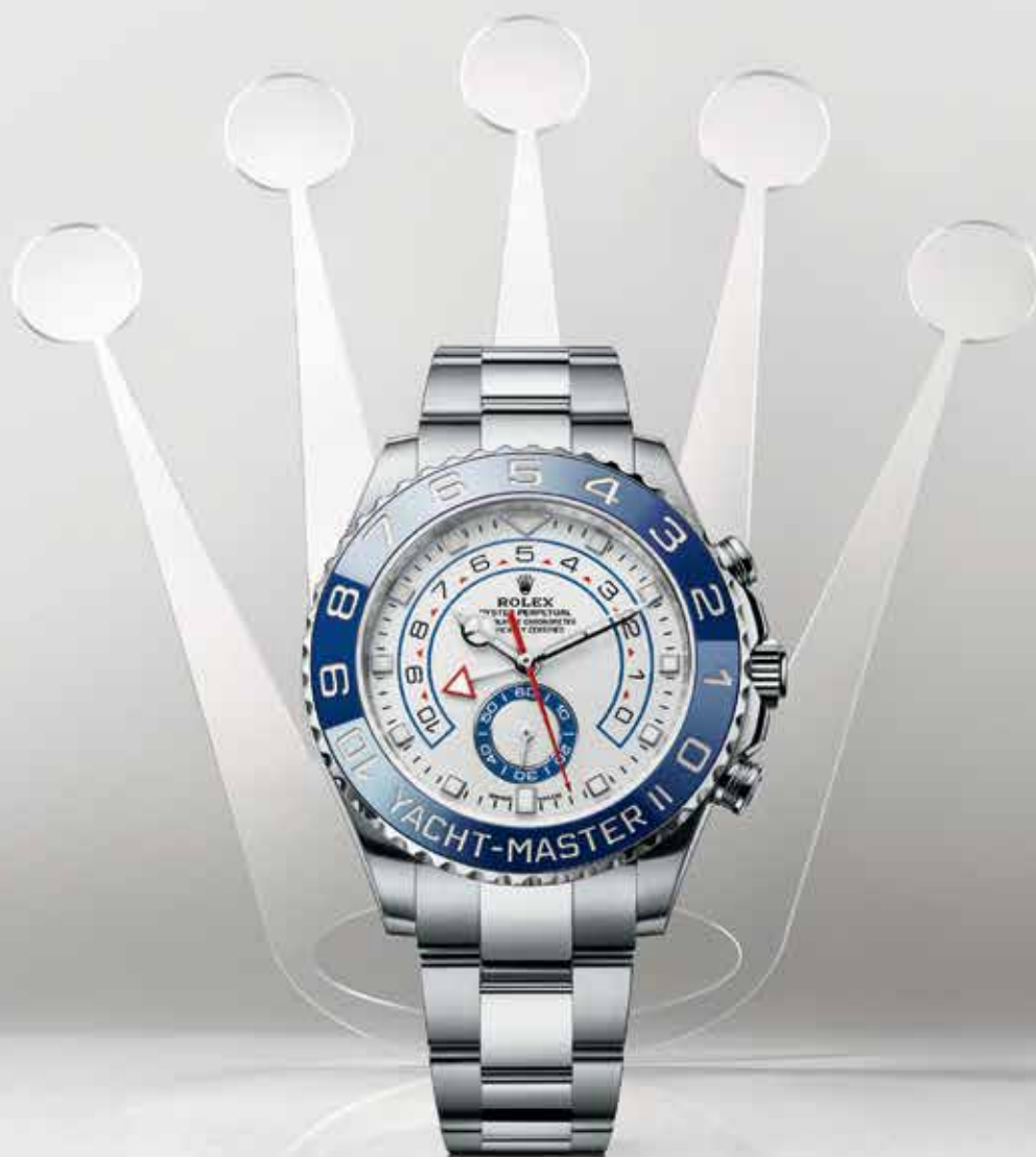
OYSTER PERPETUAL YACHT-MASTER II

The ultimate skippers' watch, steeped in yachting competition and performance, featuring an innovative regatta chronograph with a unique programmable countdown. It doesn't just tell time. It tells history.