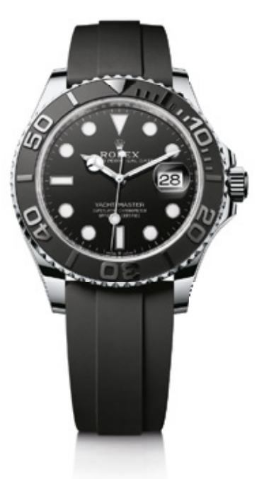
OYSTER PERPETUAL YACHT-MASTER 42 IN 18 CT WHITE GOLD