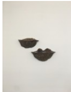
Prospective Fungal Altar 1, 2020