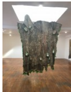
El Ruido Del Bosque Sin Hojas/The Sound Of The Forest Without Leaves, 2020

Rubber, paint and tree residue, glass, string, acrylic, wood glue, clothes