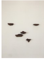
Prospective Fungal Soap Dishes 1, 2020