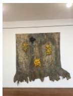
Qué Pasó Con el Azufre Que Botaron?/ What Happened With The Sulfur They Dropped?, 2020

Glazed stoneware, rubber, paint and tree residue, string, clothes