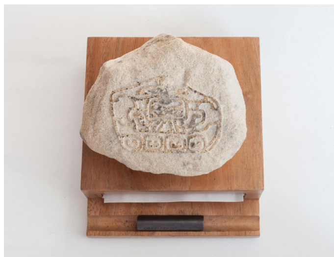
Stone CCA-t5-16, transfer stone , 2013, sandstone, mahogany, graphite on newsprint 20×24×24 cm.