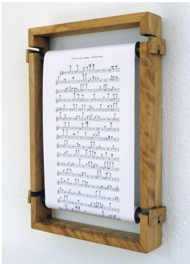
Whistling Score , 2012, wood, paper, and ink, 50 x 34 x 6.4 cm.