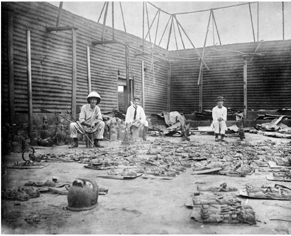
Interior of the king's compound burnt during the siege of Benin City (present-day Nigeria) in 1897, with bronze plaques in the foreground and three British soldiers of the Benin Punitive Expedition.

repatriation of the titular artifacts but emphasizes that each item has its own context, so you can't just make one rule and apply it throughout a collection. It is a matter of making the effort to catalogue and research each individual object, to see what the item needs beyond its physical conservation. And we can't just say that because they're all pots, they demand the same conditions.