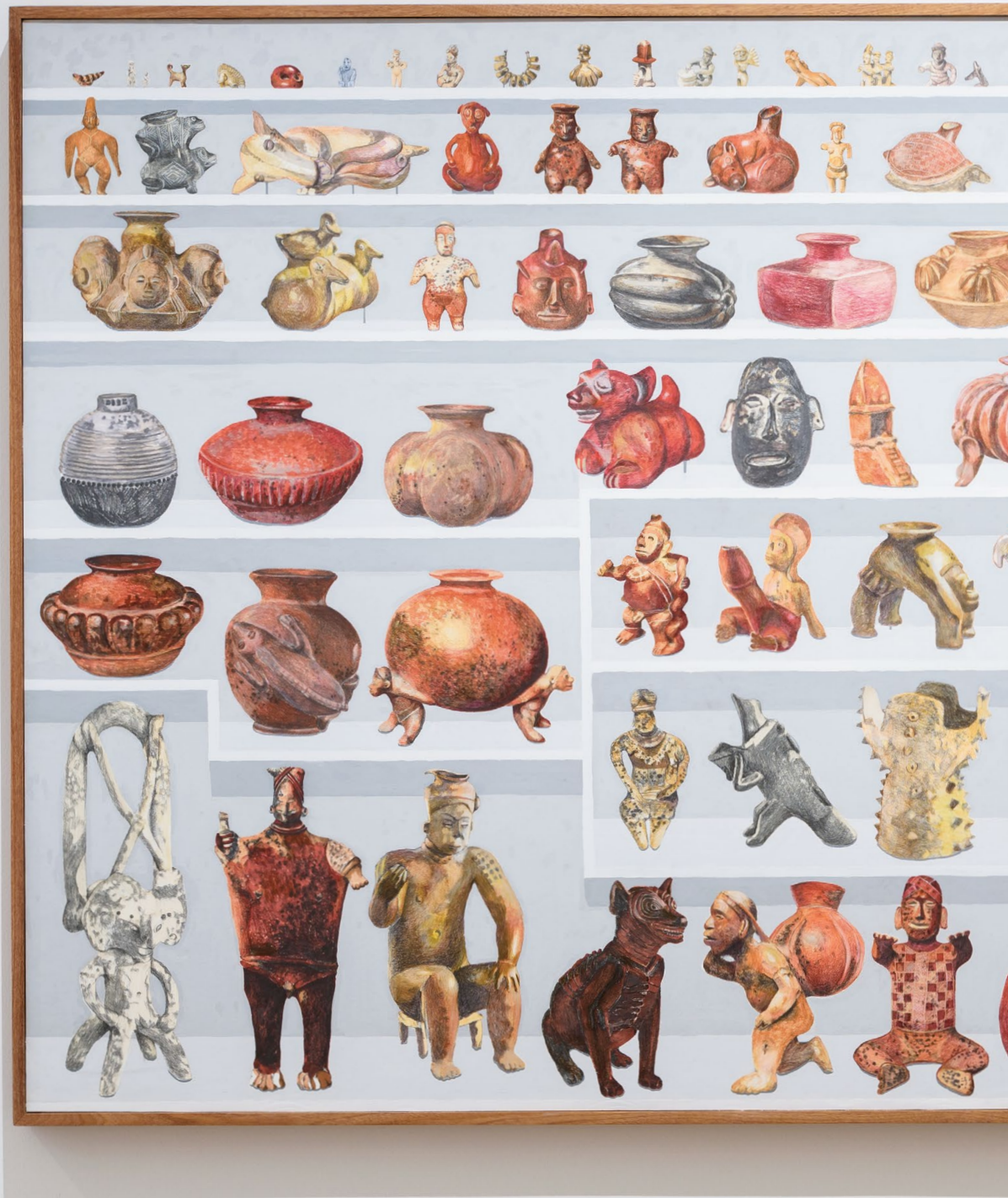
09 west Mexico ceramics from the LACMA collection: Colima Index, 2017, paintings, graphite, color pencil, and ink on paper, 186.7×339×7.6 cm.