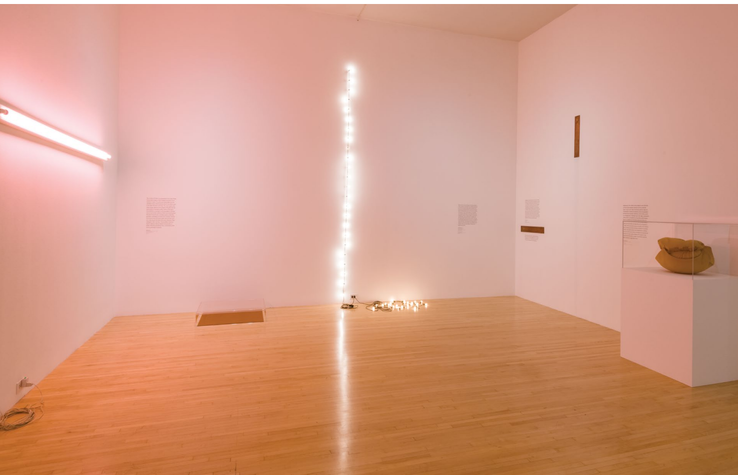
Installation view of "Open House: Gala Porrás-Kim" at the Museum of Contemporary Art Grand Avenue, Los Angeles, 2019–20.

In letters that were exchanged between the director of the Peabody and Edward H. Thompson, the archaeologist who dredged the cenote, there are conservation directions on how to inject a binding agent to hold the artifacts together because they fall apart on contact with air. Basically, the objects are now held in their shapes with glue. Collecting dust that was in the Peabody's storage is a way that the material objects can "escape" the institution. Each time my work with copal and dust gets shown, the institution where it is being exhibited is tasked with figuring a way to get "rain" onto it. I can't determine the way that water gets put on it because the institution has to somehow be compelled to facilitate the reunion between Chaac and the object. And that way, there will be a different type of reunion every time it gets shown. The drawing part