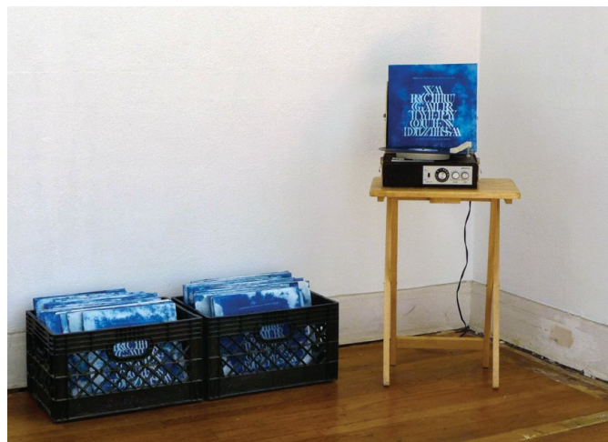
Installation view of Whistling and Language Transfiguration , 2012, LP album and cyanotype print, 30.5 x 30.5 cm, at “Whistling and Language Transfiguration,” Commonwealth and Council, Los Angeles, 2012.

Across these many interests and geographies, an ethics of genuine care suffuses her practice. When we spoke in July, Porras-Kim had just finished a residency at Delfina Foundation in London. Many of the city's major museums are the results of colonialism, built to showcase and preserve the British Empire's archeological and anthropological exotica for public consumption. We spoke about the continuity of this colonial approach that undergirds cultural repositories today and how often the conceptual essences of objects are sacrificed for the maintenance of their physical forms. The artist also shared her experiences with examining the infrastructures of institutions and their governing contracts, and working with curators and conservators to find where problems around classification, display, conservation, and interpretation are in need of re-examination and debates. It is in this context that Porras-Kim proposes alternative protocols that call on the imagination to understand what objects really want.