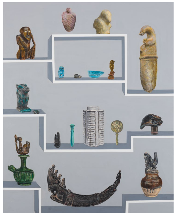
Top: 11 Mesoamerican Multiple Perspectives , 2019, graphite, color pencil, and ink on paper mounted on canvas, 152 × 122 × 5 cm.