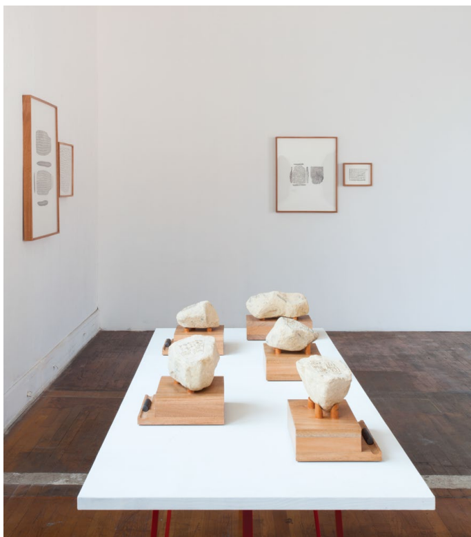
Installation view of “The Mute Object and Ancient Stories of Today” at Commonwealth and Council, Los Angeles, 2013.

I love the institution. I have lived within various institutions for most of my life. My parents are both academics, and I love history and would like to be in school forever. My concern is what I can do such that institutions do not make me feel bad. Basically, it’s very self-interested. I just don’t want to feel guilty about belonging to institutions—and I can’t complain about them unless I try to make them better.