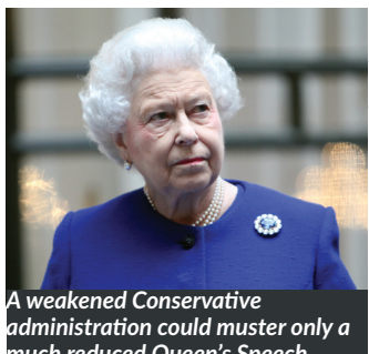
much reduced Queen's Speech

On the hot topic of EU nationals in the UK, on 26 June the PM confirmed that all EU nationals living in the UK lawfully for at least five years will be granted 'settled status' and be able to bring over spouses and children (subject to UK nationals receiving reciprocal guarantees). It remains to be seen how the EU 27 will receive these detailed proposals, having been lukewarm towards the headline proposals announced a few days earlier.