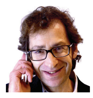
Who are you?

I am the founder of Frog Telecom, a telecoms company based in London and Paris.