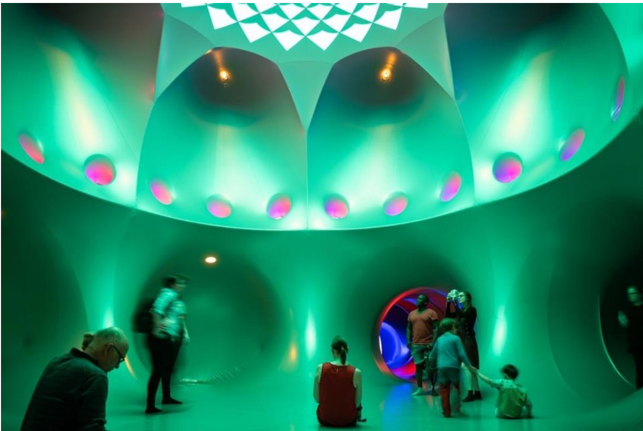
Daedalum Eight people sit and stand on the floor of the installation, surrounded by shiny circular walls that are softly lit green and fuchsia from tinted windows.

There is soft music playing inside the structure, reminiscent of whale songs. The installation is inflated with air, creating white noise.