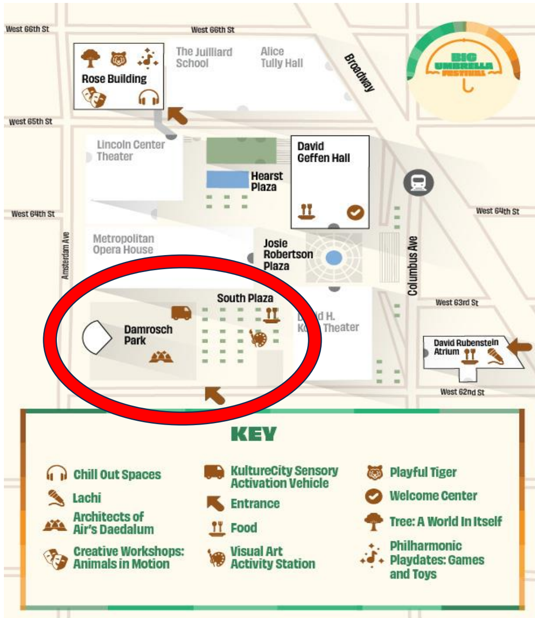
Map of the Lincoln Center for the Performing Arts campus between W 62 and 66 Streets and Columbus and Amsterdam Avenues, including Big Umbrella Festival installations and venues. There is a red circle around Damrosch Park.

Damrosch Park (circled in red) is located on the Northwest side of 62 nd Street between Amsterdam and Columbus Avenues.