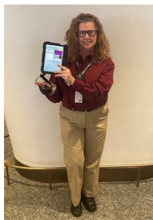
An image of a peachy-skinned white woman with auburn curly hair and black-rimmed glasses holding an iPad. She is wearing a maroon shirt, khaki pants, and a black lanyard while standing in front of a white pole.

Please ask a Lincoln Center staff member for these devices. Our Guest Experience staffers typically wear maroon-colored shirts and khaki pants.