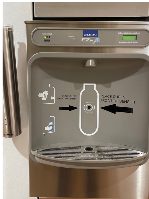
A stainless-steel water bottle refilling machine with a stainless-steel cup dispenser to its right, mounted on a white wall

There is a water fountain between the men and women's restrooms on the 7 th floor. It is a bottle-friendly machine that has cups next to it for guests without a water bottle.