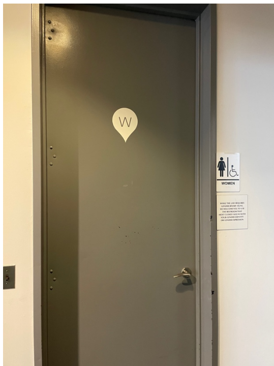
Gray door with a white speech bubble containing the letter "W". A black and white accessible women's restroom sign and gender expression sign is on the righthand side on a white wall.

Men's and women's restrooms with one accessible stall each are located down the hall to the right across from the theater on the 7th Floor. Lincoln Center welcomes guests to use the restroom that most closely aligns with their gender identity or expression, while the law requires gender binary signs.