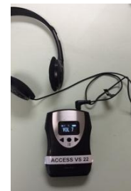
A photo of an Assisted Listening Device with a black and silver FM receiver and black headphones on a gray table

FM assistive listening devices with headsets and neck loops are available for all performances. Additionally, guests are welcome to bring their own headphones and standard jack headsets.