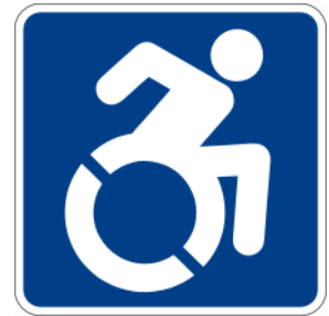
Universal access symbol: a line drawing of a person in a wheelchair, propelling themselves forward

This venue has accessible routes, with designated wheelchair and companion seating.