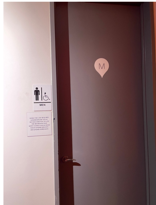
Gray door with a white speech bubble containing the letter "M". A black and white accessible men's restroom sign and gender expression sign is on the lefthand side on a white wall.