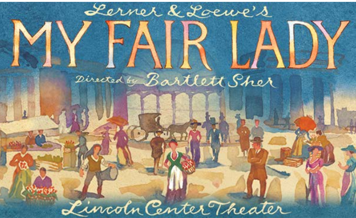
Colorful drawing of people working and moving through a bustling city center.

Join Metropolitan Opera Guild Teaching Artists in a fun and interactive journey through the classic fairy tale Cendrillon (Cinderella). The morning session is for children ages 8-12 and the afternoon session is for teens and young adults.