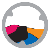
Illustration represents maximum load for combination wash and dry cycle. Fill halfway with dry clothes to leave sufficient room for clothes to tumble freely. Leave additional room when loading wet clothes.