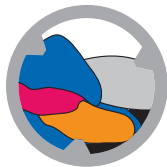
Illustration represents maximum load for a wash-only cycle. Do not pack the drum to full capacity.