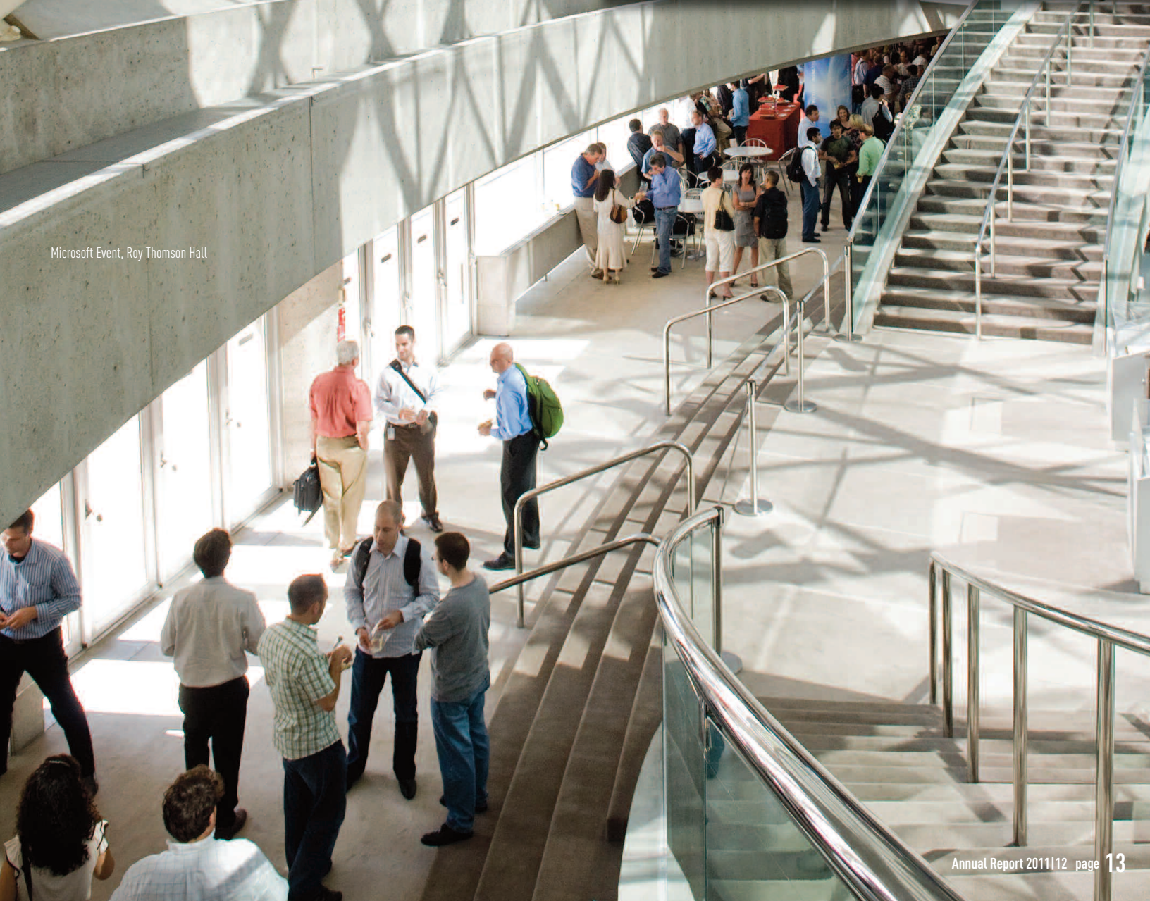
Microsoft Event, Roy Thomson Hall