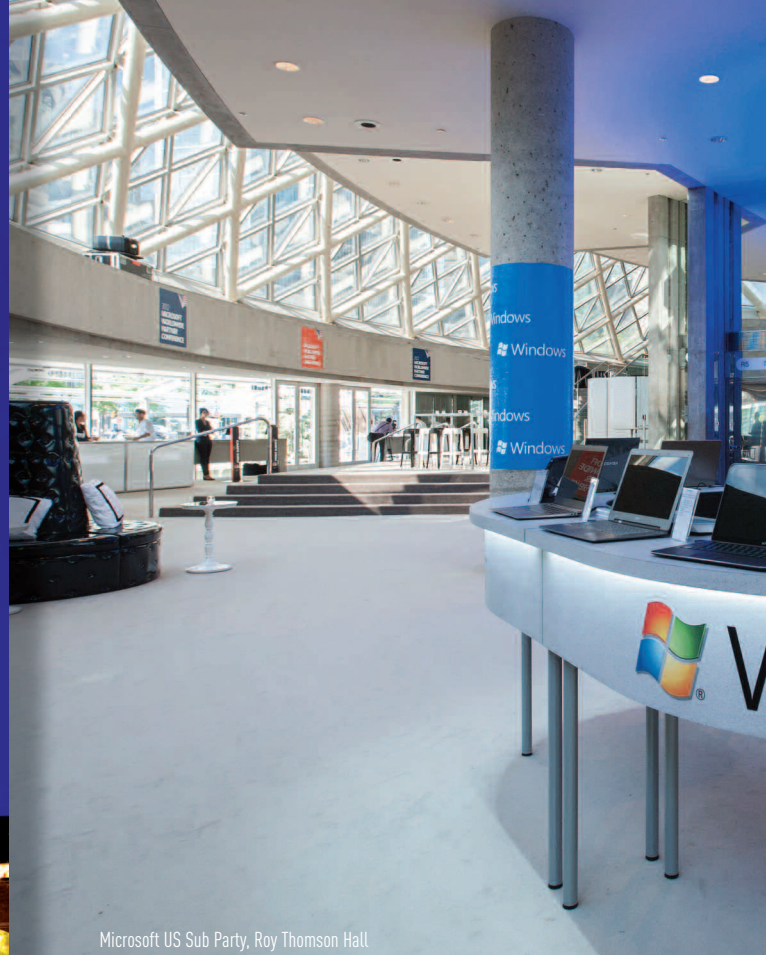
Microsoft US Sub Party, Roy Thomson Hall