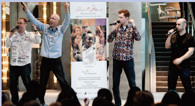
Cadence, Share the Music workshop, Roy Thomson Hall