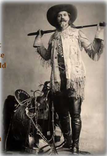
Buffalo Bill Cody 1892

The Inn's most well-known occupant was Col. William F. "Buffalo Bill" Cody. He took up residence of the Inn from 1894 to 1902. During that time, Cody would use the front lawn to hold auditions for his 'Wild West' Show. The Show depicted life of the 'Old West' featuring Native American Culture and famous western reenactments.