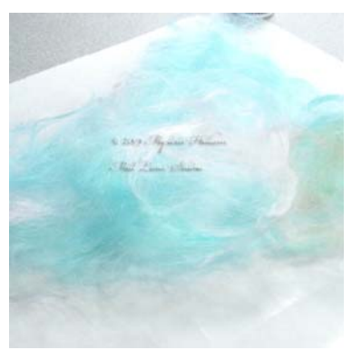
Build up several layers of the fluffed out soy silk on the freezer paper - about 2.5cm (1") thick is a good depth, but the deeper the layer, the thicker your "fabric" will be.