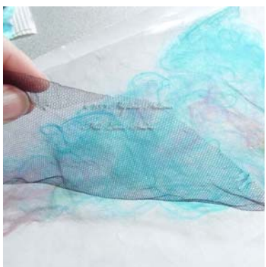
Remove the tulle and wash it in soapy water.