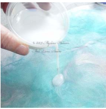
Pour the diluted Textile Medium over the entire surface of the soy fibre.