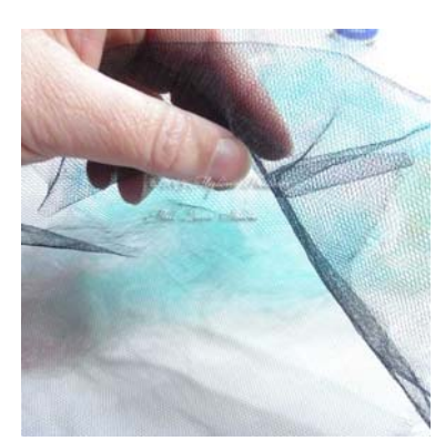
Place the tulle over the soy fibre.