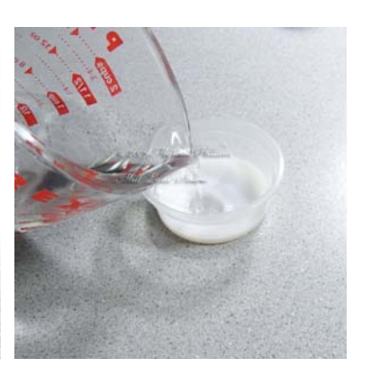
Dilute the Textile Medium with water at a ratio of 1 part Textile Medium to 3 parts water.