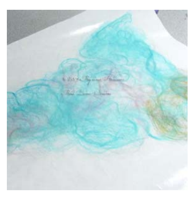
Allow the soy silk fusion fabric to dry. You can speed up drying by placing it in the sun or carefully use a heat gun.