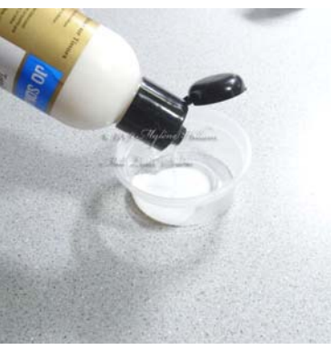
Pour a small amount of Textile Medium into a cup.