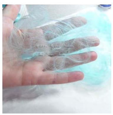
Gently pull the roving apart and fluff it up.