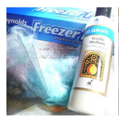
Gather all the materials required: Soy Silk fibre, Textile Medium, Freezer paper, tulle, paper towel and water.