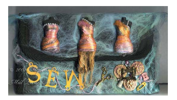
Once dry, peel your fabric from the freezer paper and it's ready for use in your next project. Here it covers a sewing kit – even the mannequins are dressed in Soy Silk Fusion fabric.