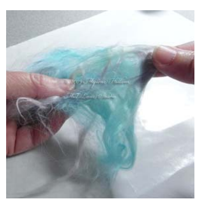
Pull a piece of the soy silk from the roving.