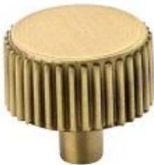
Charlotte (Brushed Brass)*

Our unique front frame system provides up to 40% more storage, utilising every square inch by providing storage wall to wall, floor to ceiling (note, the internal walls/ceiling will be visible unless optional back, side and top panels have been ordered)