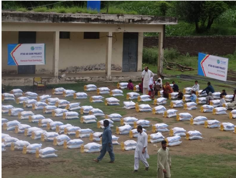
Figure 1 Gulpur distribution arrangements