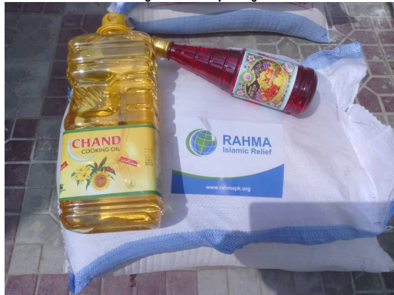
Figure 12 Close view of food package