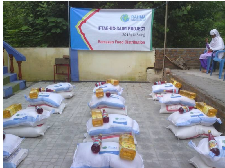
Figure 10 Food package