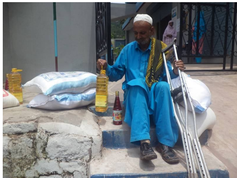
Figure 8A disable person received package