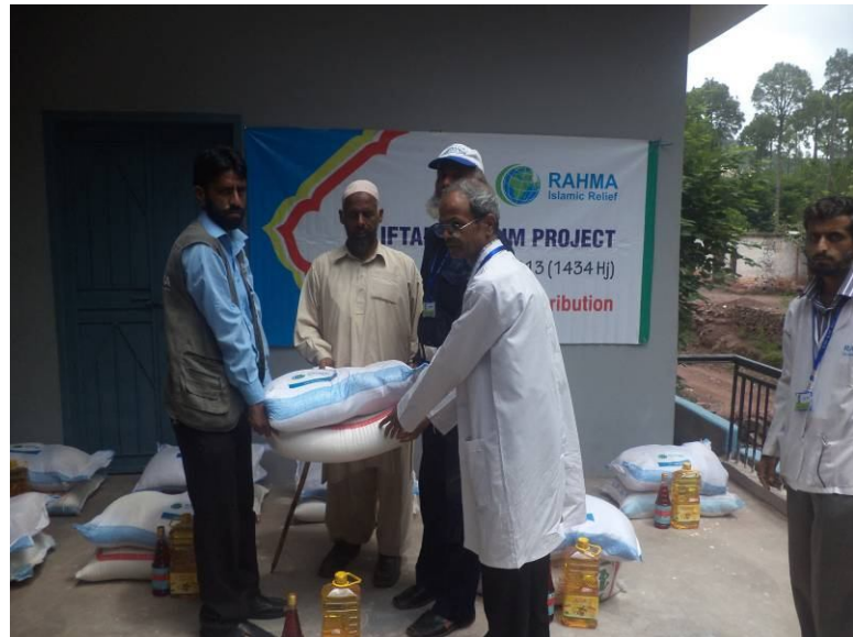
Figure 6 Beneficiary in middle receiving package