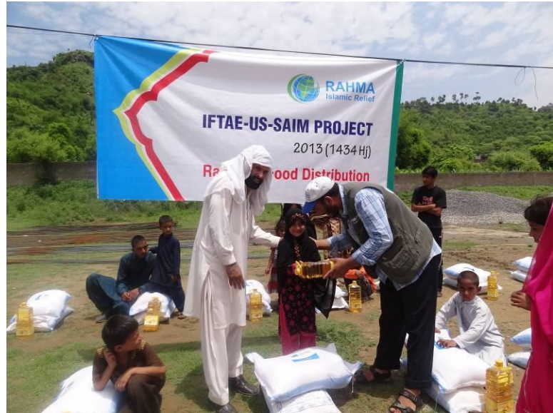
Figure 2A orphan child receiving package