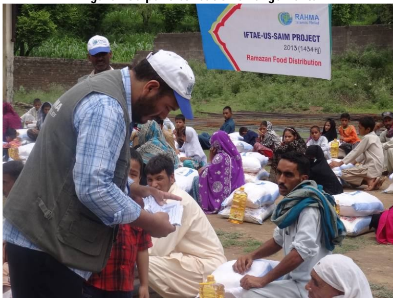
Figure 3 Token verification