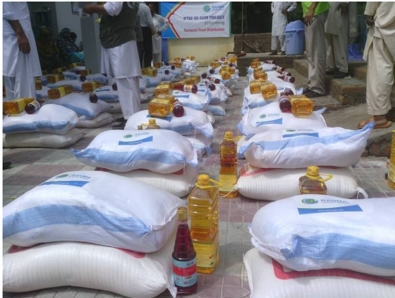
Figure 9 Food package