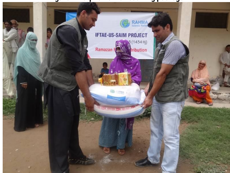
Figure 4 RIR staff handing over the package to a women