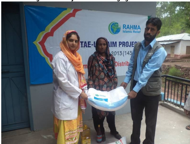
Figure 7A Female Doctor and staff providing package to needy women in the middle