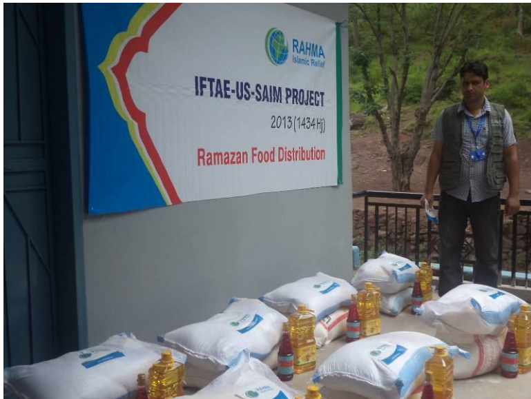
Figure 5 Staff Ajaz Ahmed arranging food items