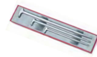
222-2994 12", 16", 20" pry bars