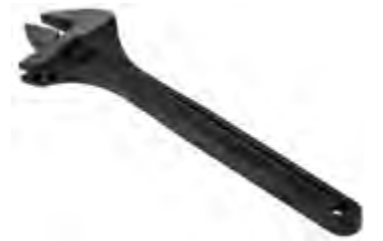
1981-685 18 inch