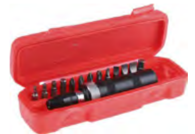
198-1749 15 piece set