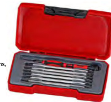
198-1860 8 Pieces