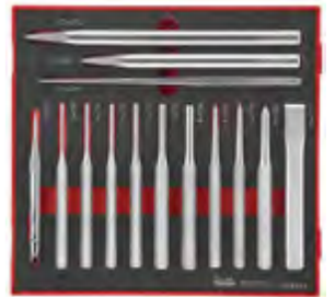
222-2970 14 piece set