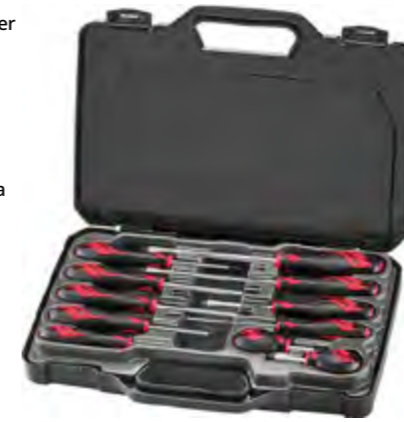
198-1852 11 Piece set