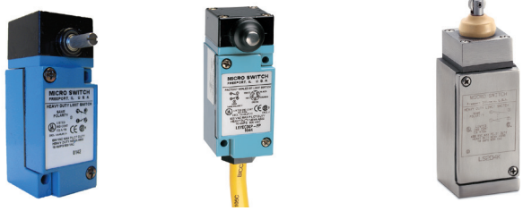
HDLS HDLS Fully Potted HDLS Stainless Steel