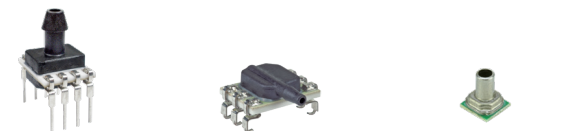
TruStability™ ABP/ABP2.0 MicroPressure MPR