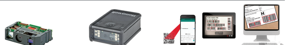
N670X Series 2D Scan Engines VuQuest 3330g SwiftDecoder™ Software