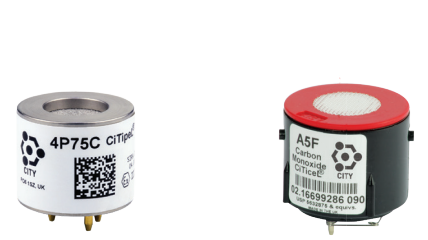
4 Series 5 Series