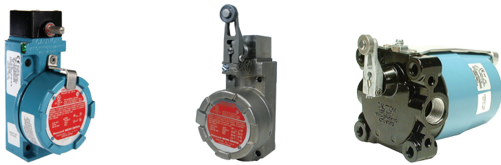
BX/LSX BX2 Stainless CX