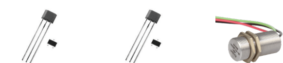
SS360/SS460/SS41K6 SM Series Nanopower 103SR