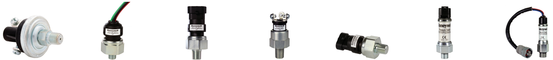
5000 LE LP ME MH HE HP