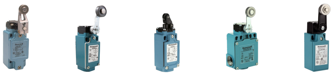
GLA GLC GLD GLE GLL