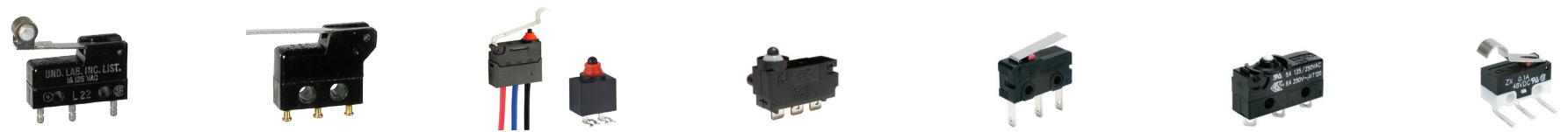
SM SX HD/HD1 ZD ZM/ZM1 ZW ZX