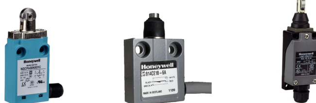
NGC 14CE/914CE SZL-VL-S