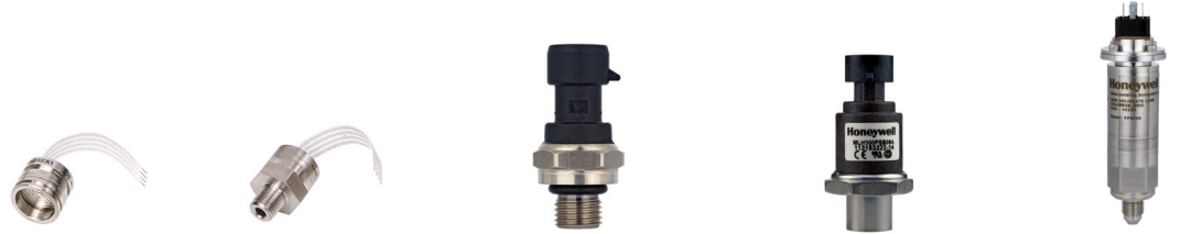
13 mm 19 mm MIP MLH FP5000