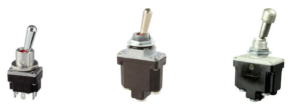
MT NT TL