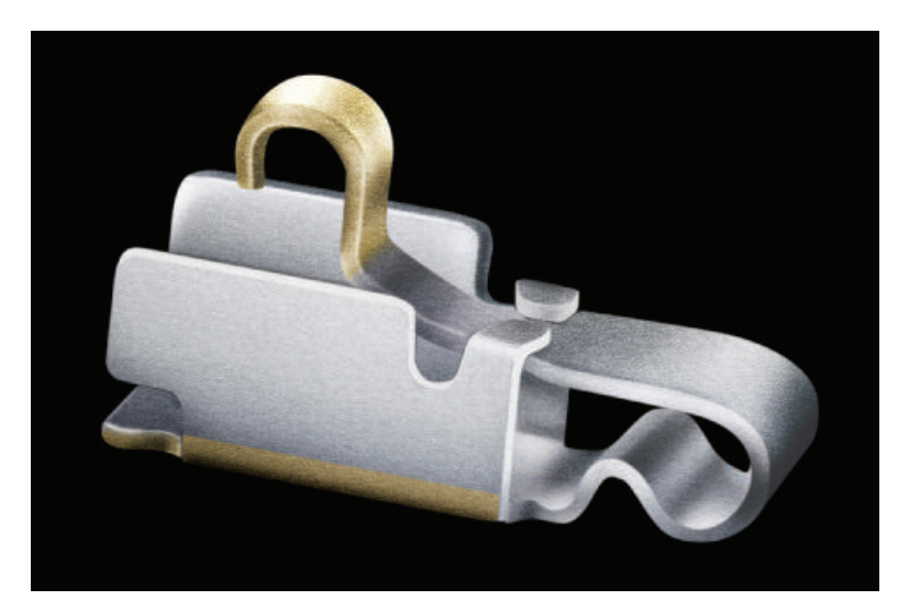
THE DOMED MATING AREA OF THE ITT UNIVERSAL CONTACT GENERATES HIGH HERTZ STRESS.

The domed design produces many other benefits, including .3N of force with only .1 mm of deflection and X-Y-Z movement that allows a robust connection between the contact and the component. Customers in many different markets – medical handheld devices, smart phones, smoke detectors, security alarm systems, military radios, memory sticks, GPS devices and dozens more – can count on