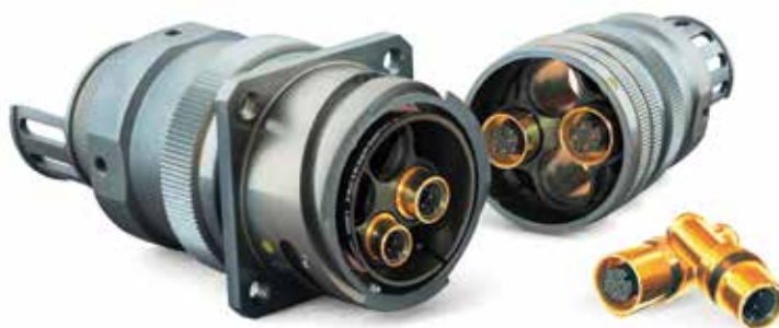
ITT Veam CIR M12 connectors

A high-performance, fault tolerant train Ethernet network is a scalable infrastructure able to transfer not only typical dedicated railway data (such as that for command, control and maintenance), but also new passenger multimedia services and IP telephony, even on existing fleets, without re-wiring coaches.