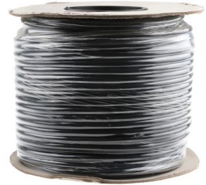
7739045 1.5 mm 2