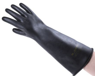
6133358 10, Large