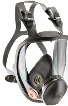
2867142 Full Mask