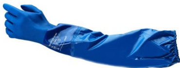
2329550 8, Medium