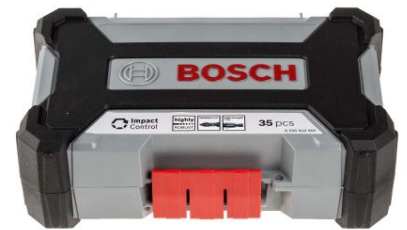
1367197 Phillips, Pozidriv, Torx