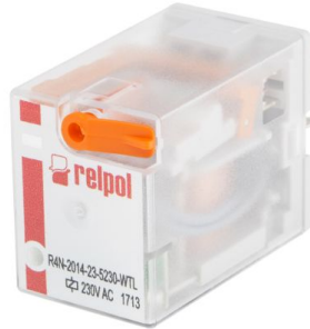
8052197 230 V ac