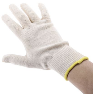
6880451 10, Large