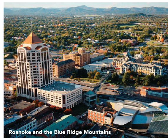
Roanoke and the Blue Ridge Mountains

If places have personalities, then Roanoke is a most vivacious Virginia city. Situated in the Blue Ridge Mountains, its lively downtown is a suitable place to recover from last year's exhausting election season and the holiday craze. Day and night,