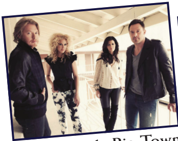
Little Big Town