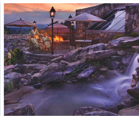
Grove Park Inn

In Asheville, you'll find a small-city oasis of cool art deco architecture, funky shops, a burgeoning river-side arts district, more than 250 independent restaurants, lots of artisan food producers, and 10 craft breweries sitting in the midst of the rocky wilds of Western North Carolina. ■