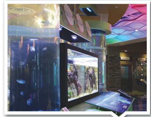
Several aquarium tanks are now housed in the atrium of the newly renovated Center in the Square attraction in Roanoke, Va.

brated its grand re-opening in March following a $30 million year-and-a-half renovation. The building now houses the city's major museums and a 340-seat theater. It also boasts an open-air rooftop green space that can accommodate up to 600 (standing), and features gardens, a koi pond and an overlook deck. The ground floor atrium offers a 6,000-gallon living-coral reef saltwater aquarium, two 500-gallon jellyfish aquariums, a seahorse estuary and considerable function space. Center in the Square has a community room and a high-tech boardroom. The facility is now registered with the U.S. Green Building Council's LEED Rating System. ■