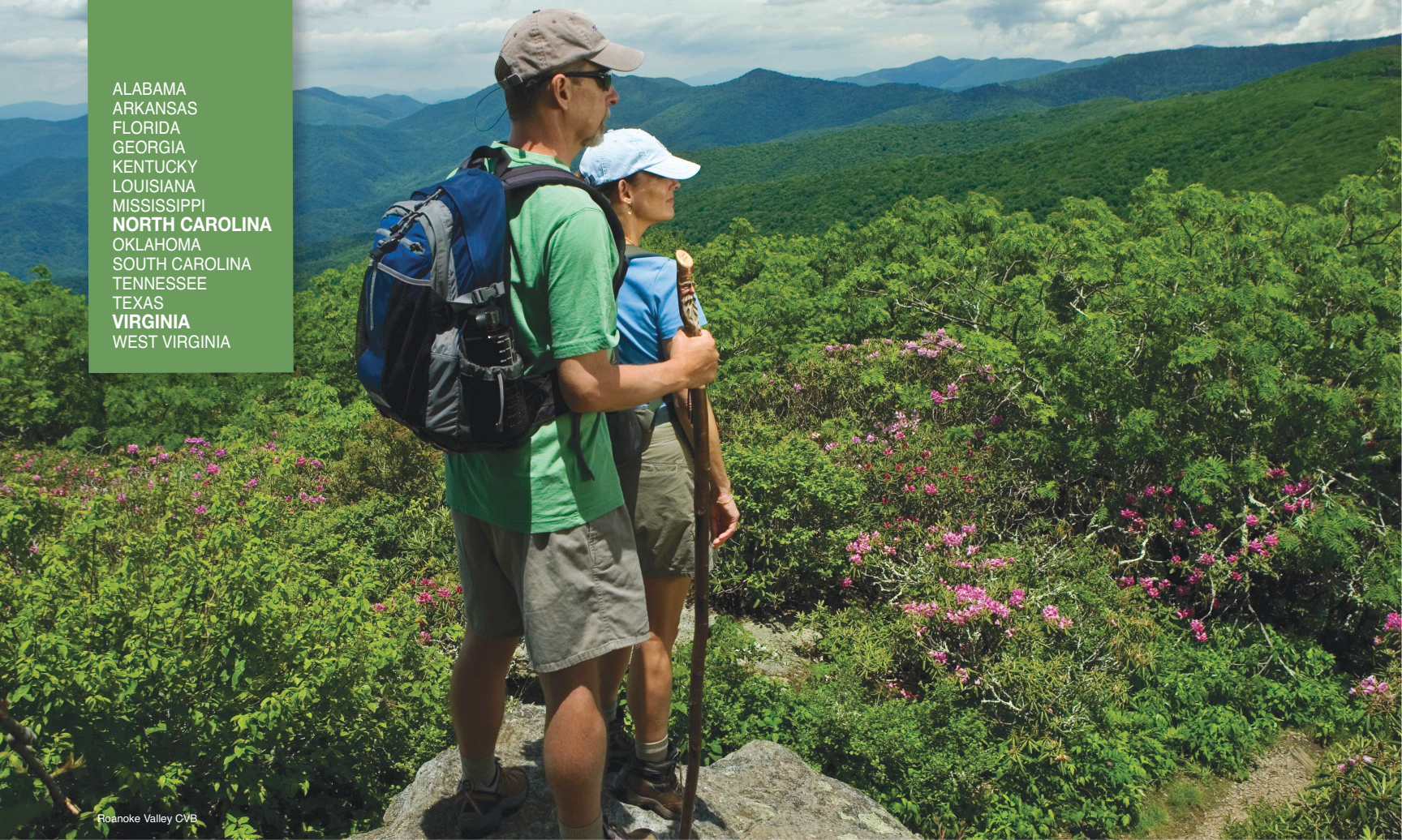
Roanoke Valley CVB

ALABAMA ARKANSAS FLORIDA GEORGIA KENTUCKY LOUISIANA MISSISSIPPI NORTH CAROLINA OKLAHOMA SOUTH CAROLINA TENNESSEE TEXAS VIRGINIA WEST VIRGINIA