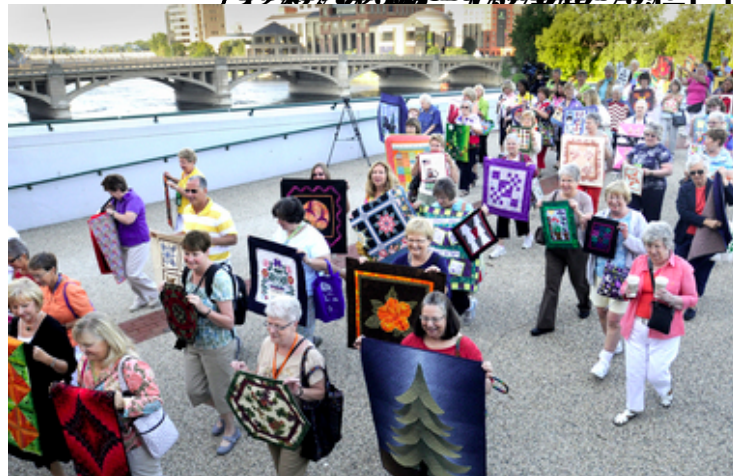
Quilters formed a "flash mob" on the Gillett Bridge last year when they are in town for the American Quilter's Society annual conference.

GRAND RAPIDS, MI – More than 21,000 members and guests of the American Quilter's Society