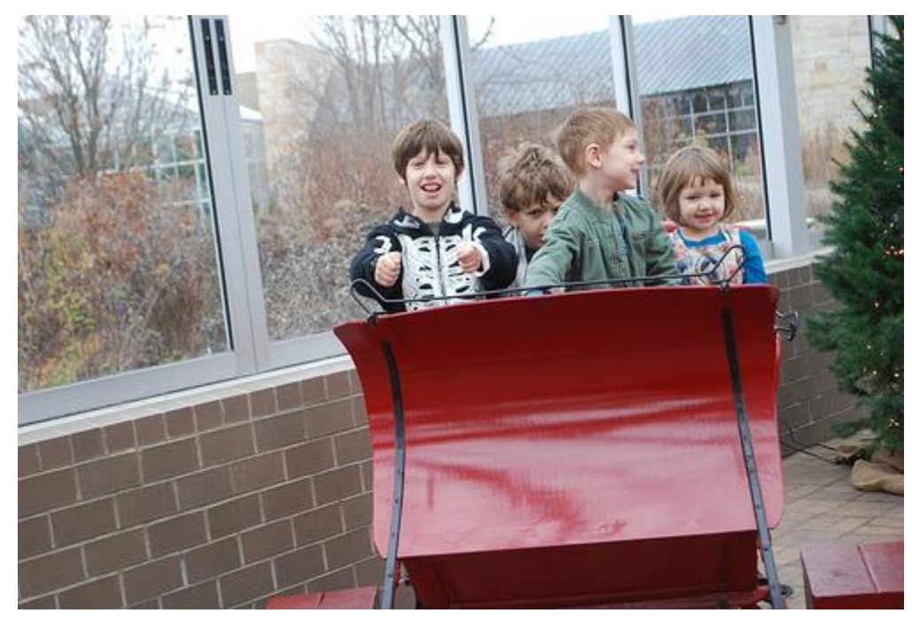
The Frederik Meijer Gardens and Sculpture Park was all be-decked for Christmas. There's even a sleigh right at the entrance perfect for photo opportunities. Over 300,000 sparkling lights are hung, and see if you can catch the Gardens Holiday Express train as it travels through the three indoor gardens.

Through January 8 you can check out the Christmas and Holiday Traditions Around the World. Trees representing countries from all over the globe line the hallways at Meijer Gardens. The kids loved looking at each one -- Carter especially loved Japan's with all the origami paper cranes. (He's really into origami right now.)