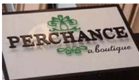
New stores that have us psyched to shop