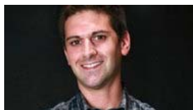
Who's getting promoted