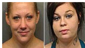
Mugs in the news